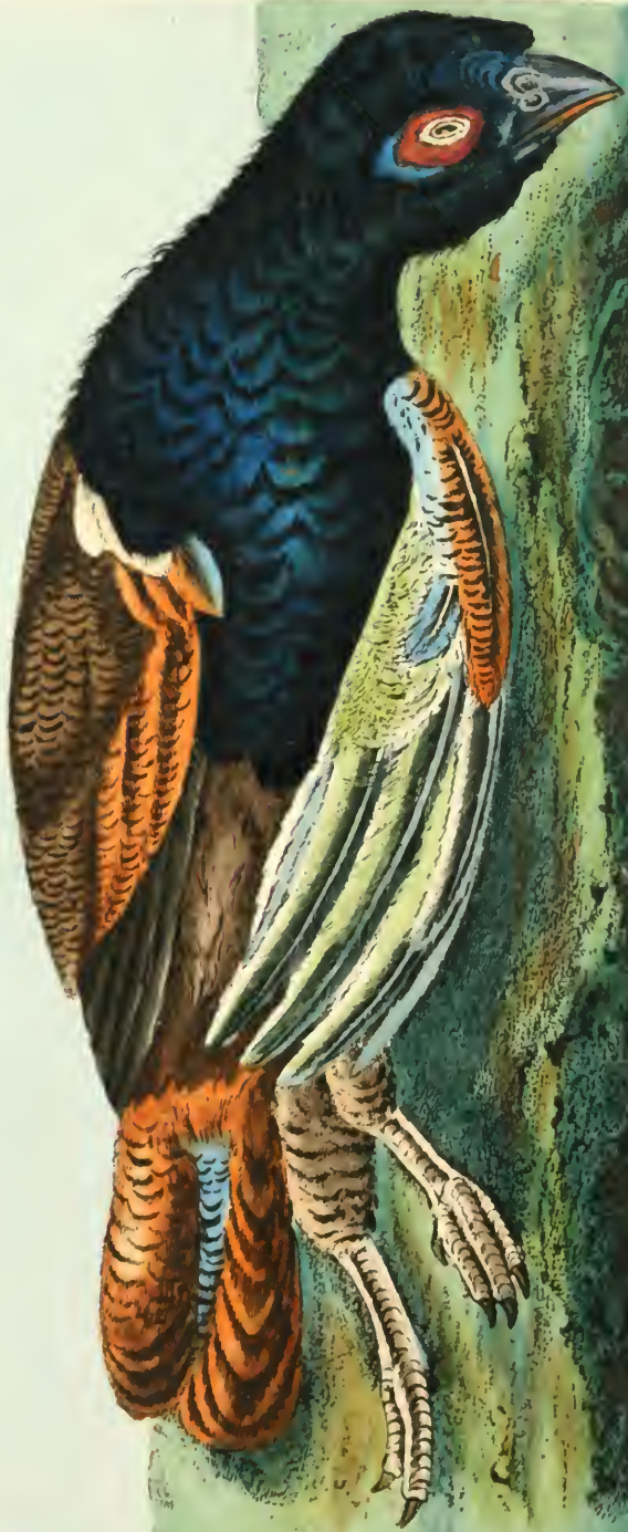
A. HYBRID BIRD.