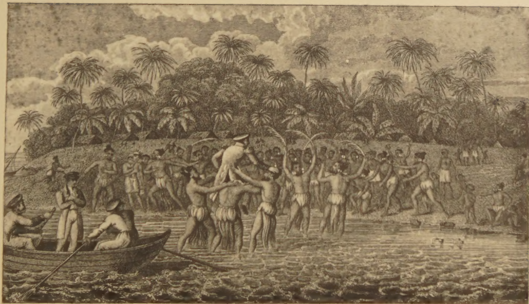
RECEPTION OF CAPTAIN KOTZEBUE AT THE ISLAND OF OTDIA.