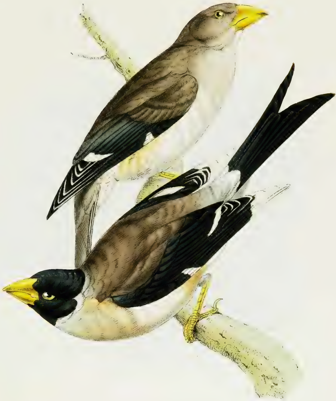
COCOTHRAUSTES melanura Fork-tailed Flycatcher