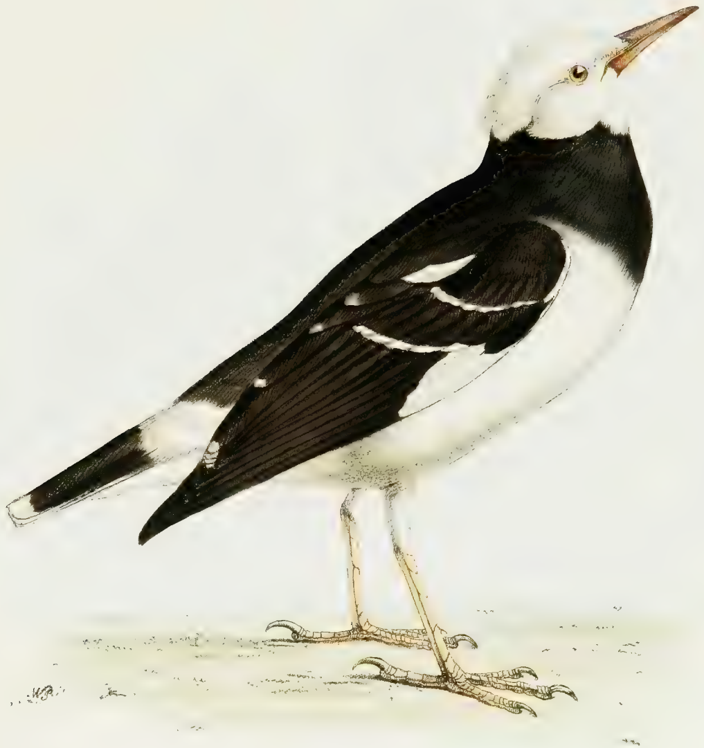
Merula cinerea Nob L. 1759