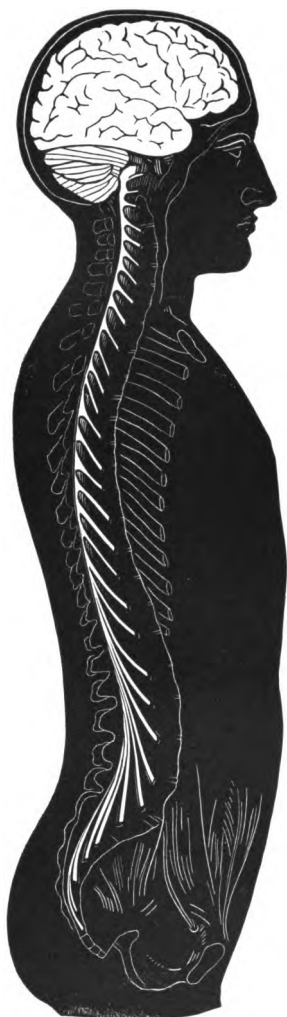
OUTLINE OF THE CEREBRO- SPINAL NERVOUS SYSTEM. Page 60.