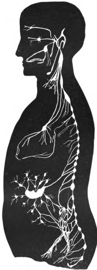
OUTLINE OF THE GREAT SYMPA- THETIC NERVOUS SYSTEM, Page 48.