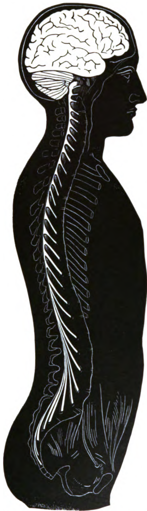
OUTLINE OF THE CEREBRO- SPINAL NERVOUS SYSTEM. Page 60.