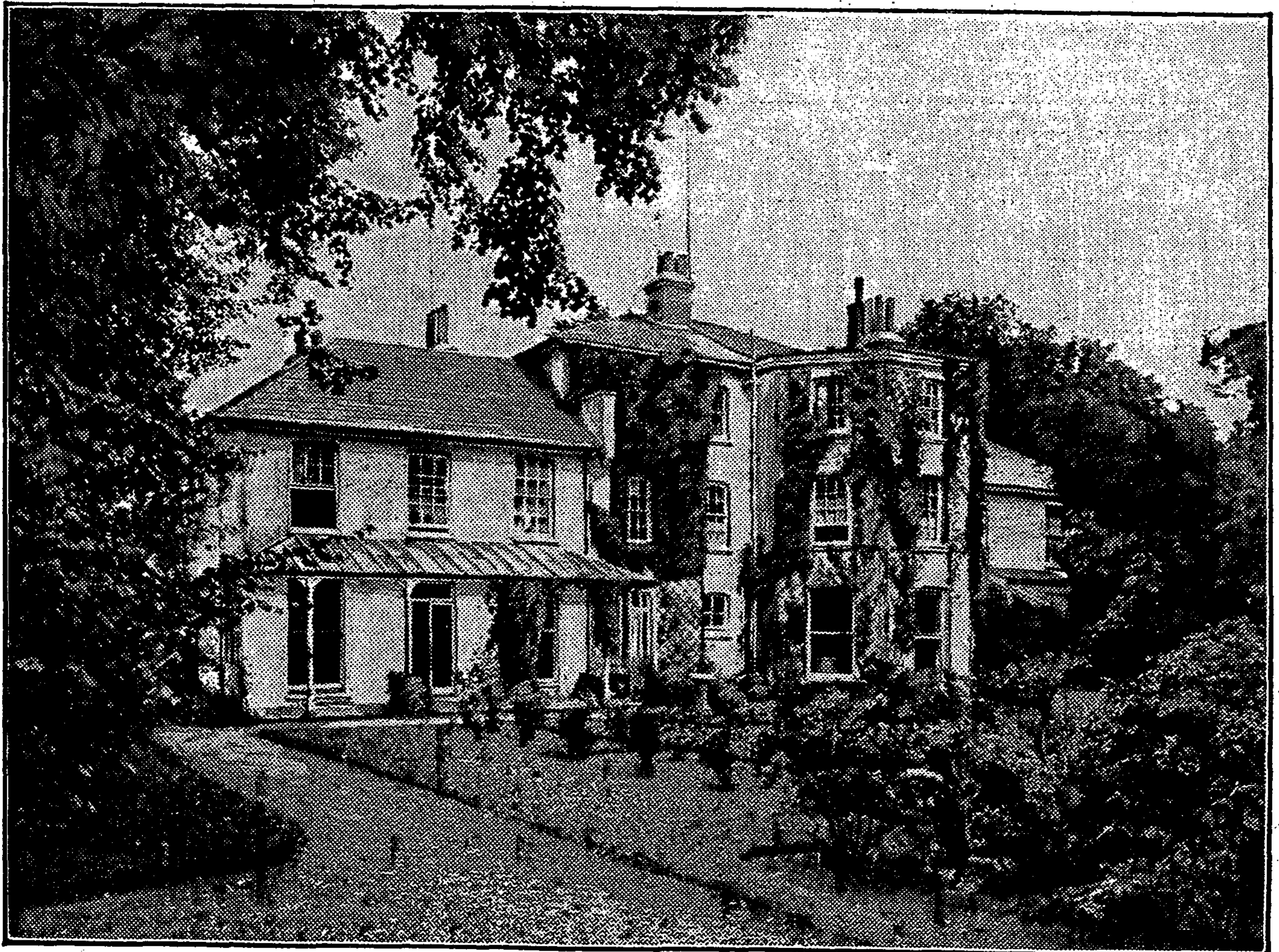
THE EXTERIOR OF CHARLES DARWIN'S HOUSE at Downe, photographed from the garden yesterday. Sir Arthur Keith, in announcing the decision of the British Association to consider the advisability of the purchase, said that the surroundings of Downe are already threatened by the speculative builder.