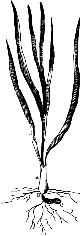
A Grain of Wheat Sown on the 12 th Jan r 1834. was in this State the 27 Jun r following. 16 Days sown.