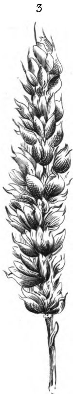
Triticum Hybridum. Coturianam à Compactum.