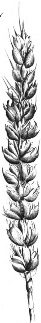
Jersey Danzig. Triticum Hybridum. Candidum Epulonum. of La Gasca.