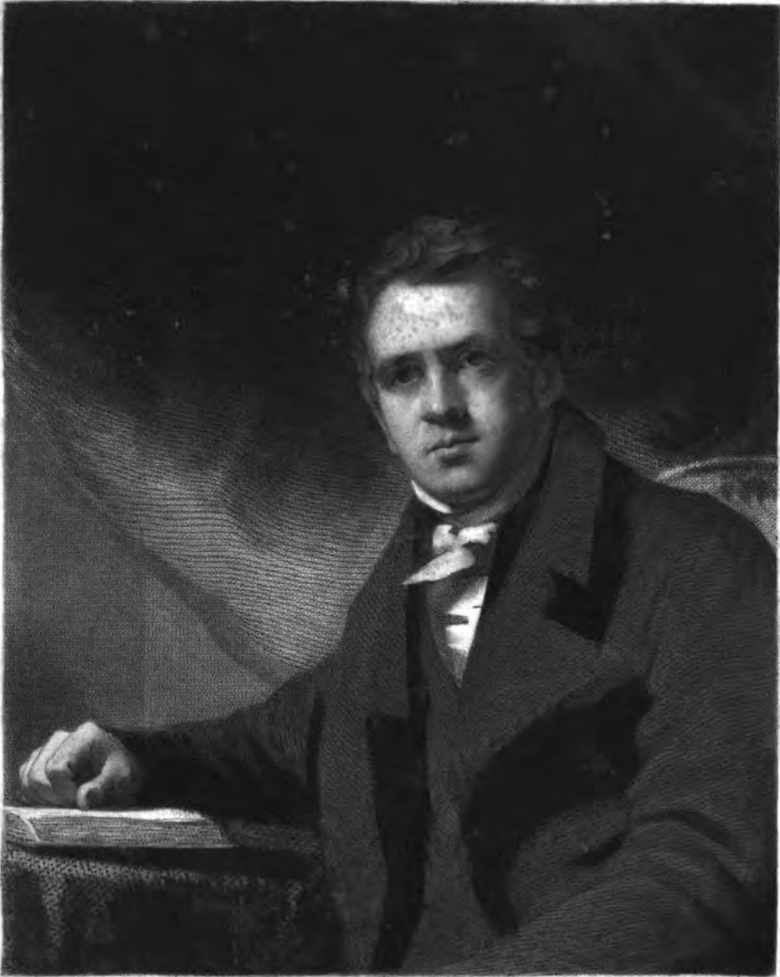
PAINTED BY SIR HENRY RAEBURN