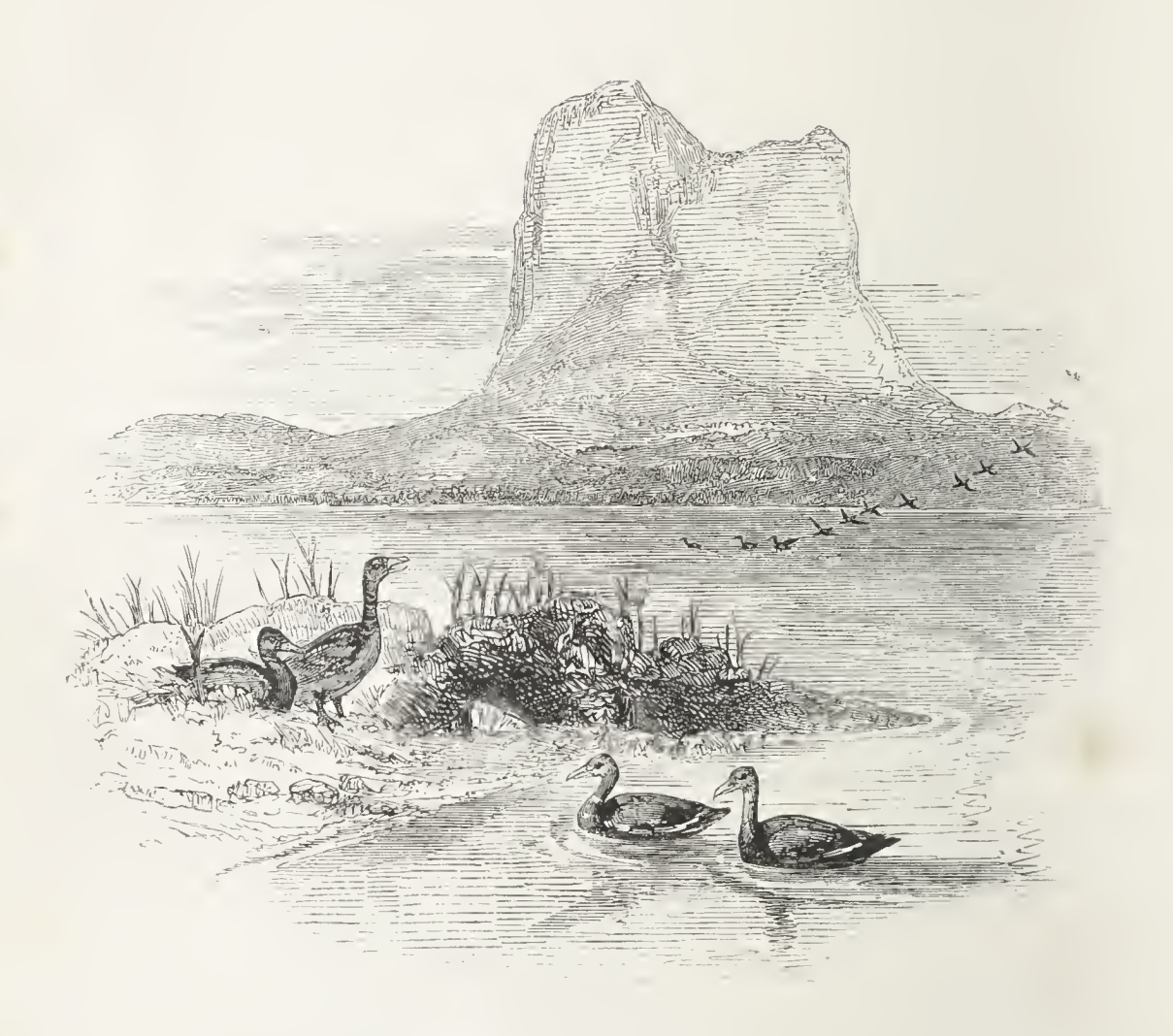
View from Loch Urigil