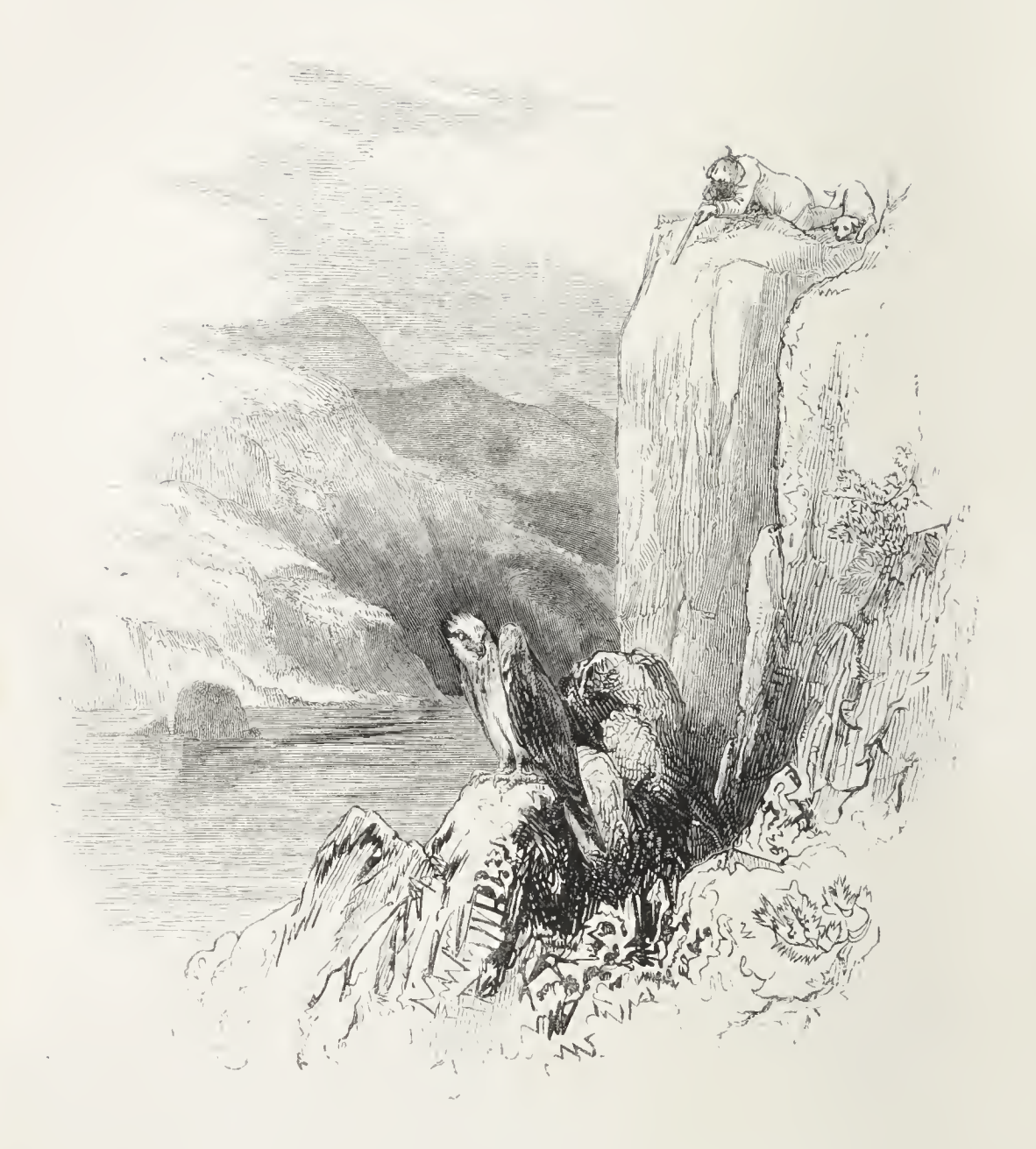
Loch near Rhiconnich.