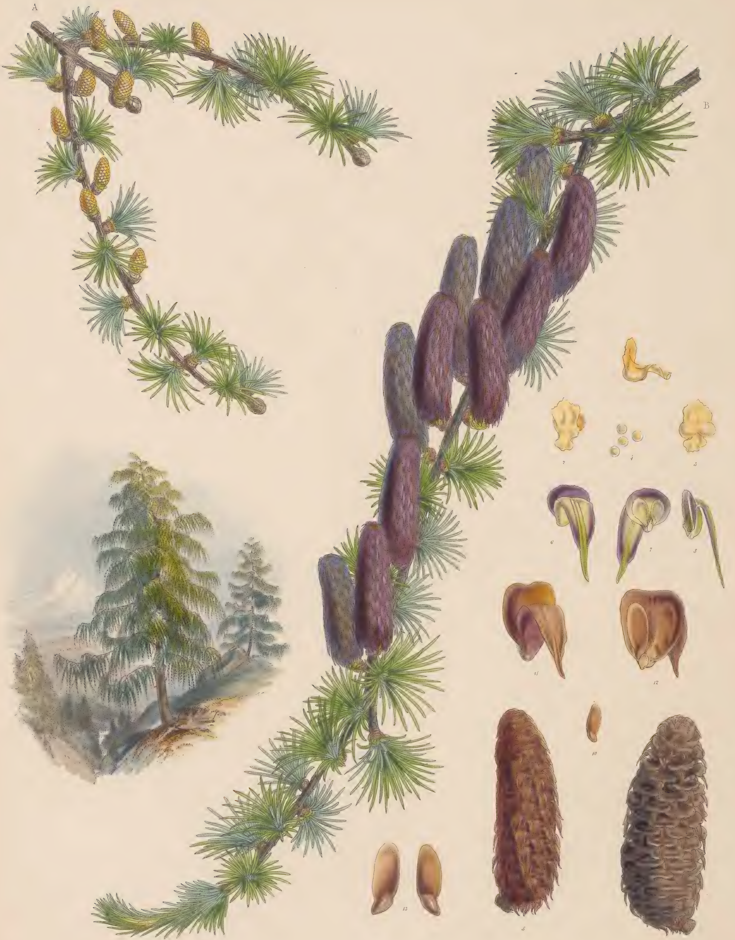
PINUS GRIFFITHII , H.F. & T.