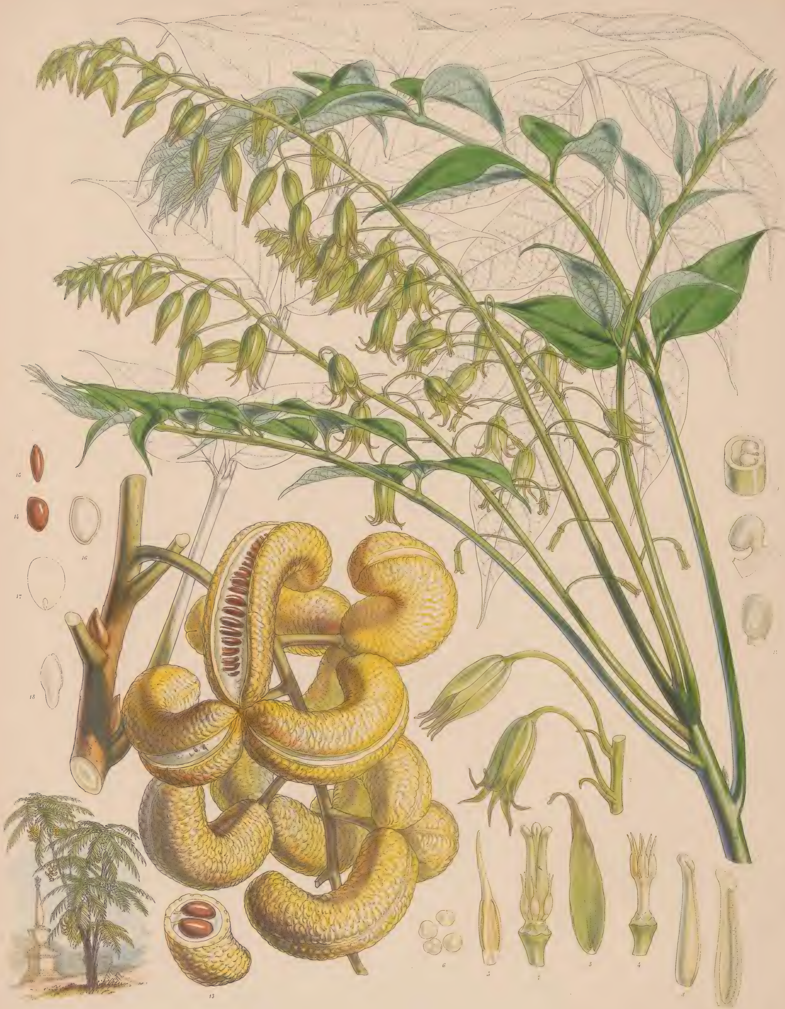
DECAISNEA INSIGNIS.