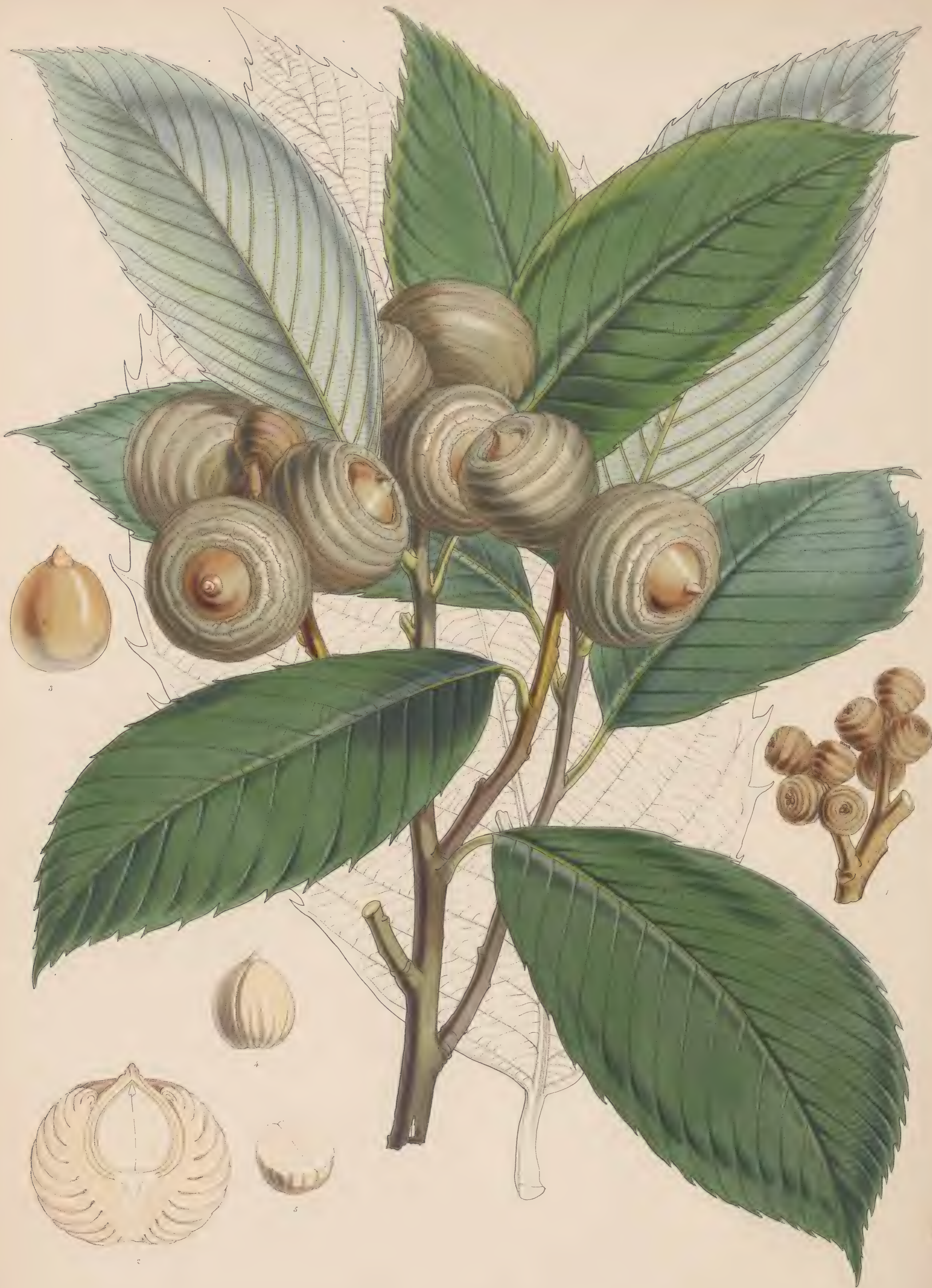
QUERCUS LAMELLOSA, Hemsl.