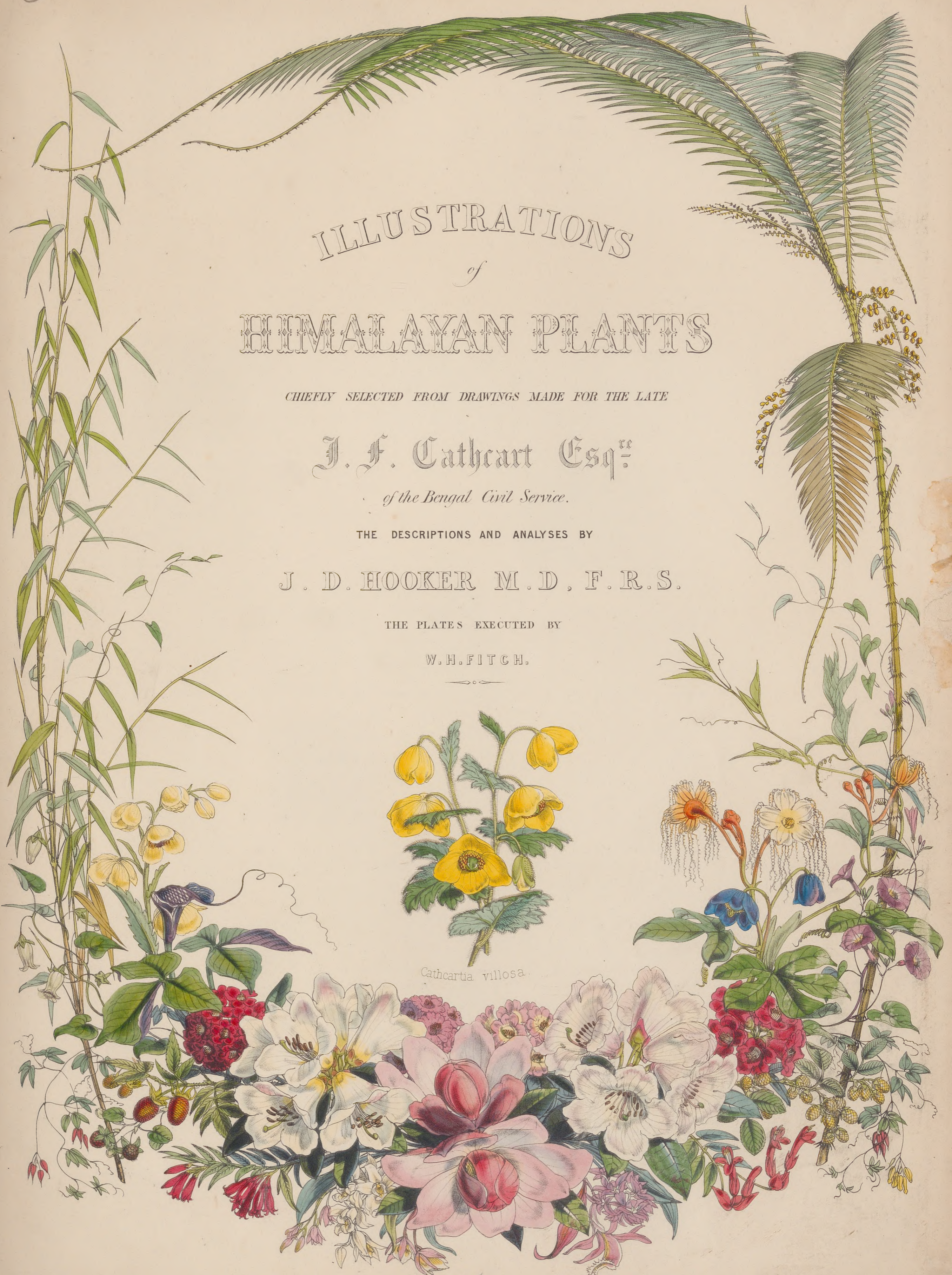
Cathcartia villosa .