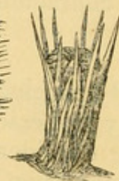
Fig. 1 represents a portion of the main axis, deprived of cœnenchyma and of nearly all its polypes.

Fig. 2 represents a branch, of the natural size, with the polypes.