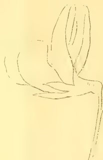
FIG. 2.— Pisum sativum (mature flower).

Pisum sativum , or Common Pea.—The blossoms are generally two upon a common peduncle, and each flower has a separate short pedicel (see Fig. 1). The peduncle generally approaches the perpendicular and