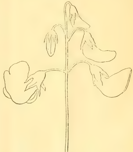
FIG. 7.— Lathyrus latifolius (Everlasting Pea).

som displays itself in the most attractive and convenient form and position for insects; the conspicuous vexillum; the wings, forming an alighting place; the attachment of the wings to the keel, by which any body pressing on the former must press down the latter; the staminal tube inclosing nectar, and affording by means of its partially free stamen with apertures on each side of its base, an open passage to an insect seeking the nectar; the moist and sticky pollen placed just where it will be swept out of the apex of the keel against the entering insect; the stiff elastic style so placed that on a pressure being applied to the keel, it will be pushed upwards out of the keel; the hairs on the style placed on that side of the style only on which there is space for the pollen, and in such a direction as to sweep it out; and the stigma so placed as to meet an entering insect,—all these become correlated parts of one elaborate mechan-