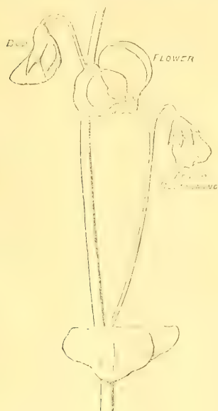
FIG. 1.— Pisum sativum (Common Pea) (peduncle and pedicels).

AFTER reading Mr. Darwin's book on Orchids and his papers on Lythrum and Primula, I made some notes on the fertilisation of Phaseolus and some of the Campanulaceæ, which had the good fortune to meet with his approval, and which he had the kindness to send for publication to the Annals and Magazine of Natural History , where they appeared in October 1868. The comparison of Phaseolus with other Papilionaceous flowers led me to think that Mr. Darwin's fertile ideas might receive many illustrations from the structure and functions of this beautiful and interesting tribe; and the following are observations made during the summer of 1869 upon