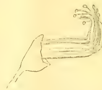
FIG. 3.— Pisum sativum (lateral view of pistil and staminal tube, with calyx and corolla removed, and tenth stamen separated).

The wings are slightly attached to the keel at the base of their limbs; and the limbs project outwards and a