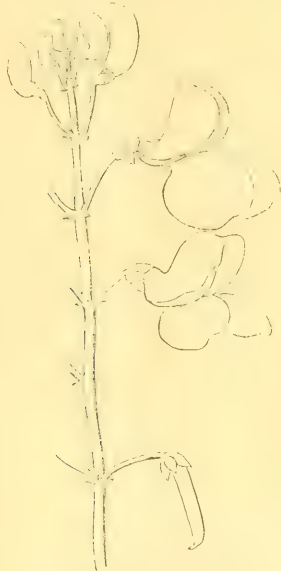
FIG. 8.— Phascolus multiflorus (Scarlet Runner).

Lathyrus pistiformis is like the other Lathyrini in the above points, except that in the long raceme of flowers, the whole peduncle, and not only the pedicels of the separate flowers, is pendent in the bud. It stiffens and becomes upright as the blossoms open, and the pedicels also stiffen and become horizontal. After flowering the peduncle remains stiff and upright, but the pedicels droop.