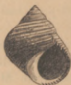
Littorina littorea , Linn.

Believing that, in past times as at present, the dispersion of forms took place in similar ways, it is interesting to look ahead to a time when the present mud and sand of the shores shall have been converted and consolidated into stratified rocks with the species entombed in a fossil condition. We may imagine a future Barrande finding material for an onslaught on the derivative theory by pointing to the abundant occurrence of this species in a narrow bed of rock of the same horizon and occurring over hundreds of miles of territory, when the beds just below reveal no vestige of this large and vigorous species.