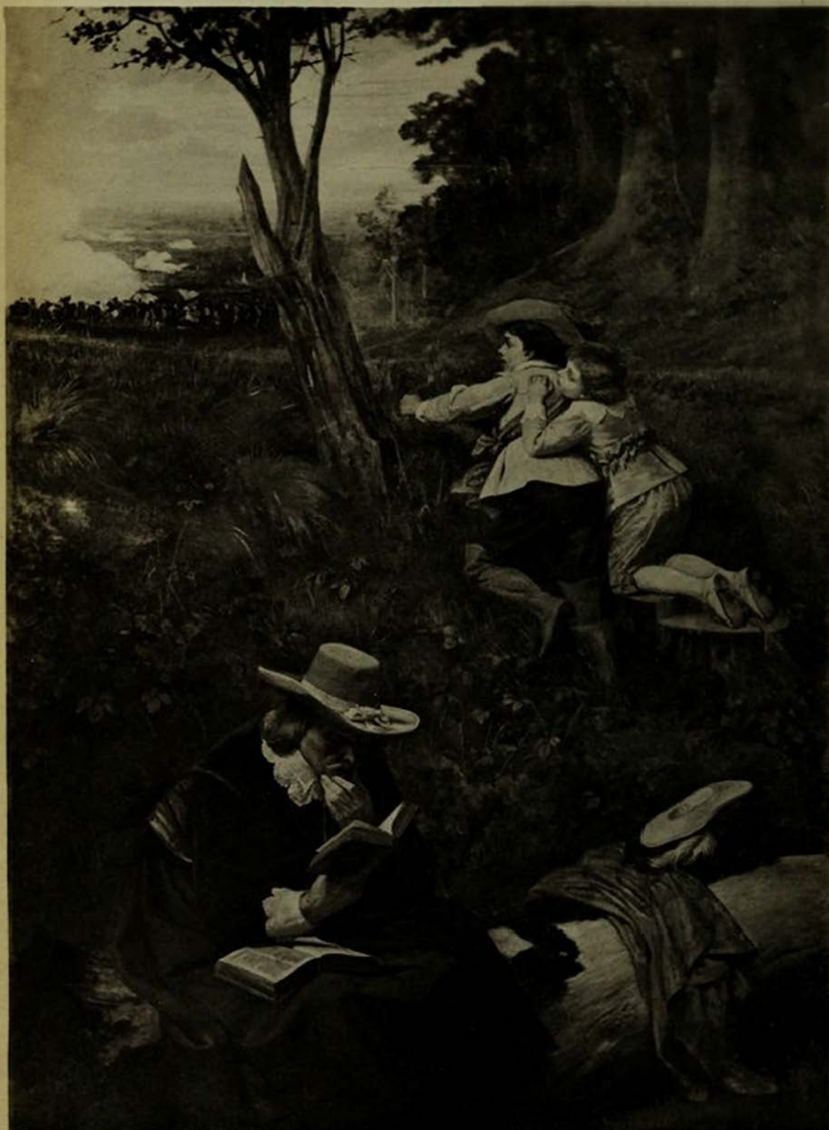
HARVEY WITH THE TWO CHILDREN OF CHARLES I.