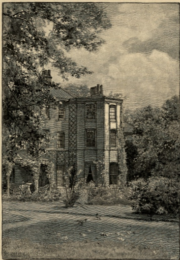
DOWN HOUSE, FROM THE GARDEN.

Origin of Species,"—we must take a hasty glance at the progress of the science of natural history during the preceding century.