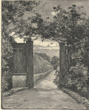
DARWIN'S USUAL WALK.

is itself a powerful instrument of research; has shown us how to combine into one consistent whole the facts accumulated by all the separate classes of workers, and has thereby revolutionized the whole study of nature. Let us endeavor to see by what means he arrived at this vast result.