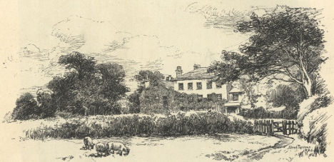
DOWN HOUSE, FROM THE PATHWAY TO THE VILLAGE.

exists or ever has existed on the globe was known to involve difficulties and contradictions of the most serious nature; although it was seen that many of the facts revealed by comparative anatomy, by embryology, by geographical distribution, and by geological succession, were utterly unmeaning, and even misleading, in view of it; yet, down to the period we have named, it may be fairly stated that nine-tenths of the students of nature unhesitatingly accepted it as literally true, while the other tenth, though hesitating as to the actual independent creation, were none the less