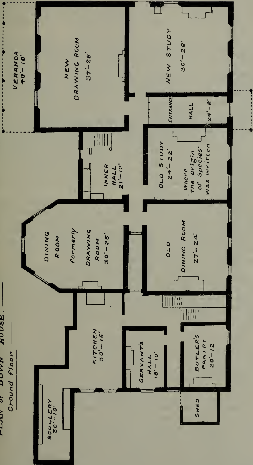
PLAN of DOWN HOUSE. Ground floor