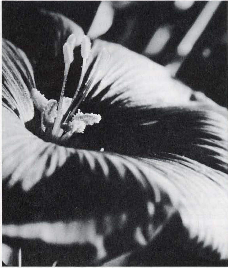
Fig. 38. Styles and stamens of Linum perenne , long-styled form (enlarged).