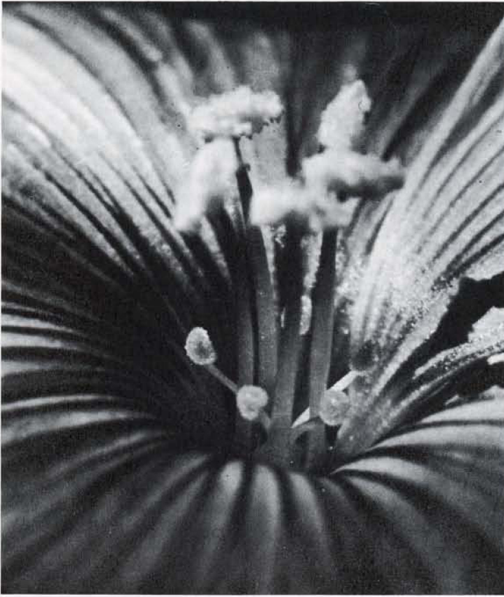
Fig. 39. Styles and stamens of Linum perenne , short-styled form (enlarged).